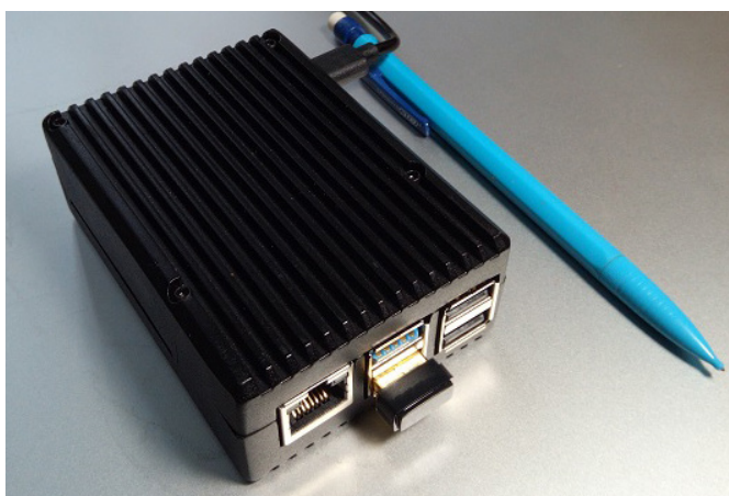
EDBox from Ed4free

Leveraging advanced satellite technology, updates and new educational materials can be delivered directly to servers in remote or underserved areas. This ensures that educational content remains up-to-date and accessible, even without reliable internet connections. By utilizing satellite broadcasting, educational institutions can consistently receive the latest resources, thereby improving the quality and reach of education in these regions.